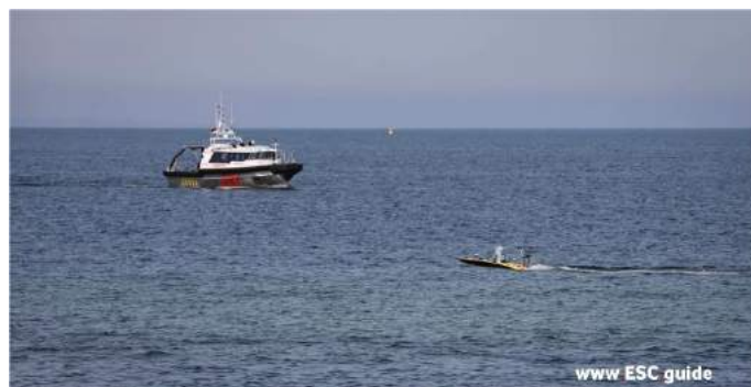
08/06/23: UUV and USV Operations in Putlos, Germany https://www.esc.guide/post/08-06-23-uuv-and-usv-operations-in-putlos-germany

To enhance logistics support for expeditionary forces.