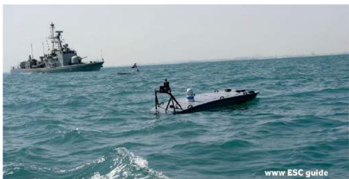
22/06/20: Creating a Convergence of Technologies to Defeat the Deadly Fast Inshore Attack Craft Threat Before 2050

https://www.esc.guide/post/22-06-20-creating-a-convergence-of-technologies-to-defeat-the-deadly-fast-inshore-attack-craft-thre