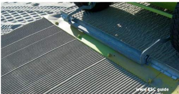
BARBER / SURF RAKE - #BeachCleaningMachines

Hydrobike water bikes have been synonymous with fun & fitness on the water in 74 countries since our founder invented our pedal-powered water bike 25 years ago, in USA. Non-polluting, easy to ride, lightweight, safe and stable with 400 lbs flotation, Hydrobikes are enjoyed by everyone from 8-90. Seniors love our Hydrobikes!