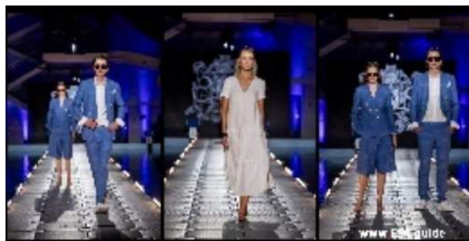
BULDOCK / Case Study: Tallinn Fashion Week 2024

Transform your next event with BulDock's versatile floating platforms. Enjoyed by thousands at the 2024 Tallinn Fashion Week, our floating runway at Kalev Spa showed how water can be turned into a spectacular event space.