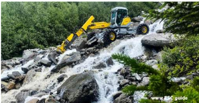
MENZI MUCK #Anti-Flood Projects

The Menzi Muck allterrain spider #excavator even proves its versatility within the context of water supply and distribution.