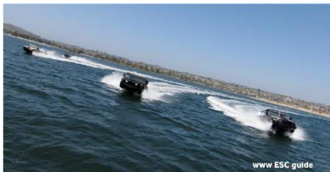
WATERCAR / H1-Panther