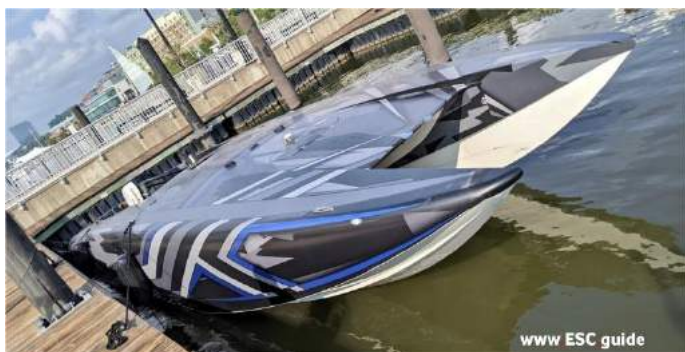
08/06/22: U.S. Marine Corps explores using #USV https://www.esc.guide/post/08-06-22-u-s-marine-corps-explores-using-usv

To enhance logistics support for expeditionary forces.