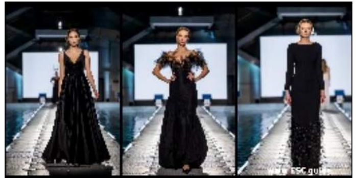
BULDOCK / Case Study: Tallinn Fashion Week 2024 https://www.esc.guide/post/buldock-case-study-tallinn-fashion-week-2024 Transform your next event with BulDock's versatile floating platforms. Enjoyed by thousands at the 2024 Tallinn Fashion Week, our floating runway at Kalev Spa showed how water can be turned into a spectacular event space.