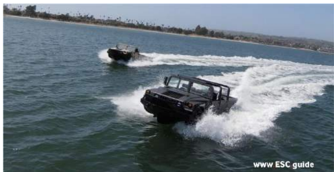
WATERCAR / H1-Panther - Operational Instructions Video

The end product speaks for the skill and tenaciousness of the #WaterCar team in USA. Capable of highway speeds on land and thirty-five knots on water, the four-wheel-drive H1-Panther transitions between land and water in under 20 seconds.