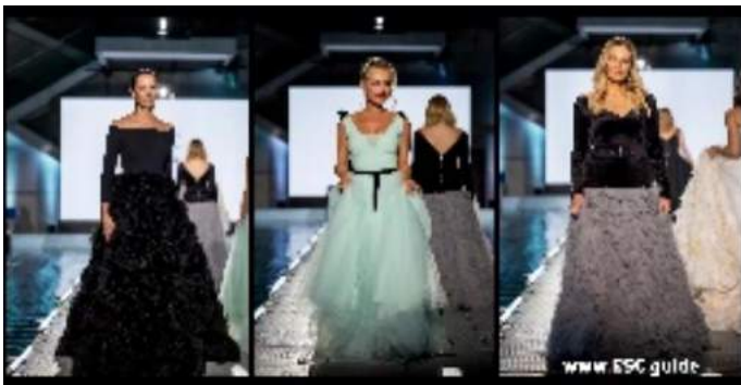
BULDOCK / Case Study: Tallinn Fashion Week 2024

Transform your next event with BulDock's versatile floating platforms. Enjoyed by thousands at the 2024 Tallinn Fashion Week, our floating runway at Kalev Spa showed how water can be turned into a spectacular event space.