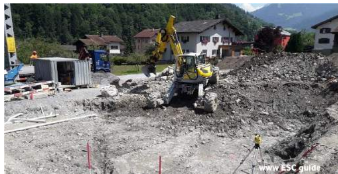
MENZI MUCK #Construction

World's First Electric Amphibious Vehicle.