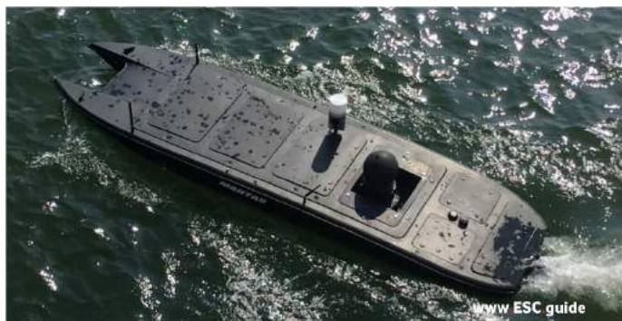
11/06/21: MARTAC Overview

https://www.esc.guide/post/11-06-21-martac-overview