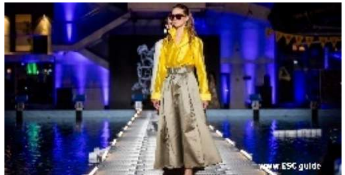
BULDOCK / Case Study: Tallinn Fashion Week 2024

Transform your next event with BulDock's versatile floating platforms. Enjoyed by thousands at the 2024 Tallinn Fashion Week, our floating runway at Kalev Spa showed how water can be turned into a spectacular event space.