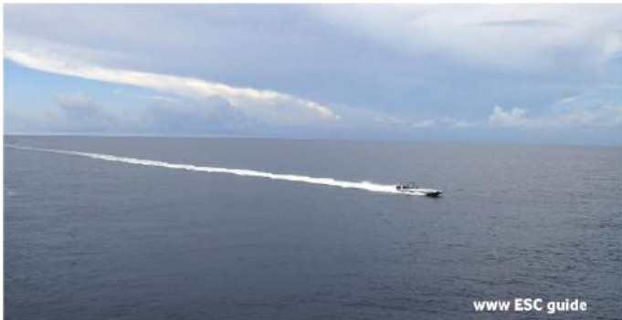
25/06/22: A Devil Ray T-38 unmanned surface vessel and littoral combat ship USS Sioux City (LCS 11) sail in the Arabian Gulf

https://www.esc.guide/post/25-06-22-a-devil-ray-t-38-unmanned-surface-vessel-and-littoral-combat-ship-uss-sioux-city-lcs-11