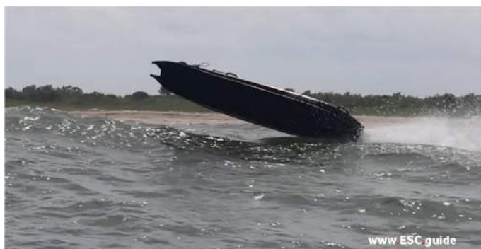
11/06/21: MANTAS T8 in Rough Water https://www.esc.guide/post/11-06-21-mantas-t8-in-rough-water 2.5m #USV (video)