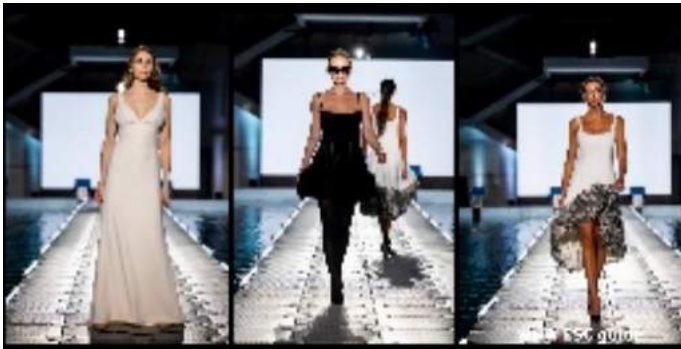
BULDOCK / Case Study: Tallinn Fashion Week 2024 https://www.esc.guide/post/buldock-case-study-tallinn-fashion-week-2024 Transform your next event with BulDock's versatile floating platforms. Enjoyed by thousands at the 2024 Tallinn Fashion Week, our floating runway at Kalev Spa showed how water can be turned into a spectacular event space.