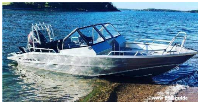
UMS 545 DC https://www.esc.guide/post/ums-545-dc

The aft seat can accommodate 3 people, which allows you to comfortably relax and travel in a company of up to five people in a boat. But it should be kept in mind that at full load, the maximum drive will be available with the maximum engine!