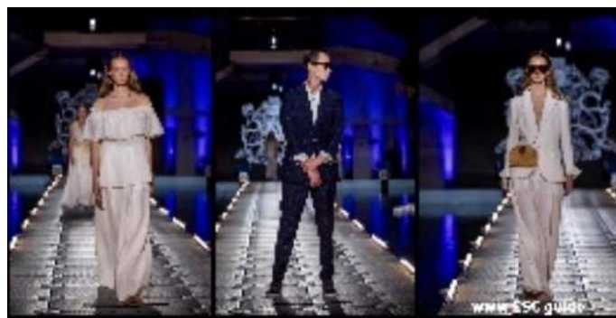
BULDOCK / Case Study: Tallinn Fashion Week 2024

Transform your next event with BulDock's versatile floating platforms. Enjoyed by thousands at the 2024 Tallinn Fashion Week, our floating runway at Kalev Spa showed how water can be turned into a spectacular event space.