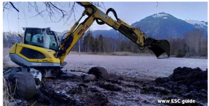
MENZI MUCK M525

In #construction Menzi Muck is a synonym for an extremely versatile and powerful tool.