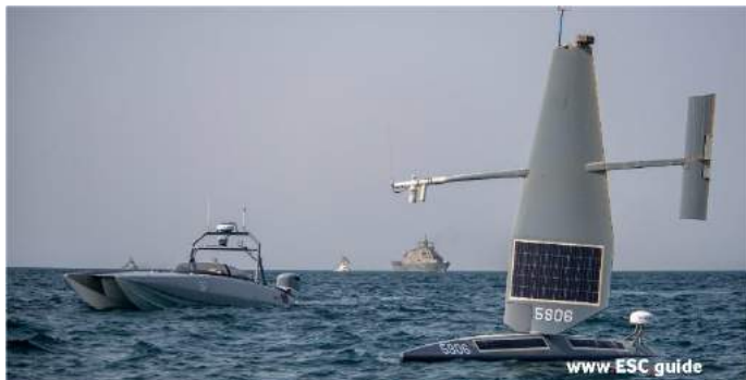
28/06/22: Quiet Developments in the 5th Fleet

https://www.esc.guide/post/28-06-22-quiet-developments-in-5th-fleet