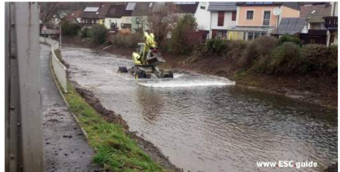
MENZI MUCK #RiverCleaning

June 26. U.S. naval forces regularly operate across the Middle East region to help ensure security and stability.