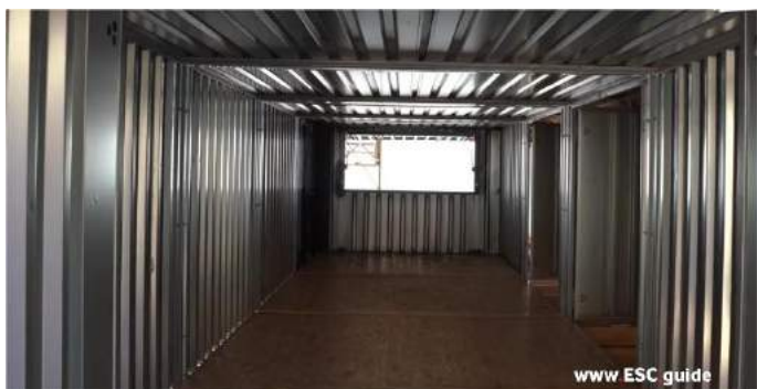
Beachside Modified Shipping Containers in Black RAL 9005

#BALTOPS 23, a cooperative maritime exercise, provides an ideal environment for exploring and evaluating new capabilities and technologies. This year, it highlights the increasing systems' powers of the U.S. Sixth Fleet.