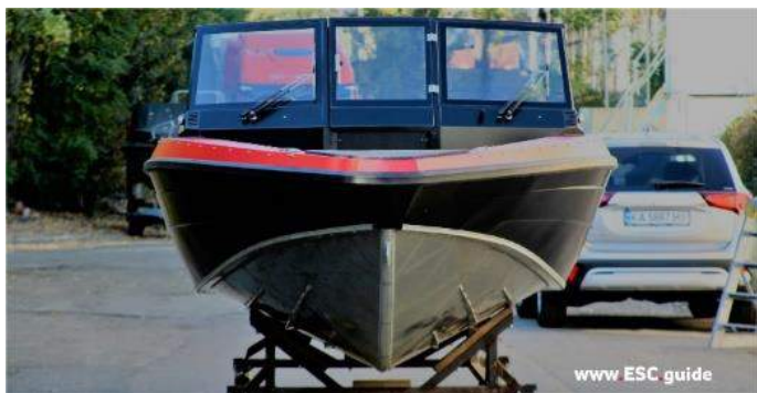
UMS 655 DC Fishing

#MANAMA, #Bahrain - USS Sioux City (LCS 11) arrived to Bahrain for a scheduled port visit, June 25, marking the completion of a 10,000-mile journey while becoming the first littoral combat ship to operate in the Middle East.