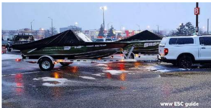
UMS 545 DC Fishing https://www.esc.guide/post/ums-545-dc-fishing

#PUTLOS, Germany (June 9, 2023) A #MARTAC T-12 unmanned surface vehicle (#USV), bottom right, practices hunting for mines as part of exercise Baltic Operations 2023 (#BALTOPS 23). BALTOPS 23 is the premier maritime-focused exercise in the Baltic Region. The exercise, led by U.S. Naval Forces Europe-Africa, and executed by Naval Striking and Support Forces #NATO, provides a unique training opportunity to strengthen combined response capabilities critical to preserving freedom of navigation and security in the Baltic Sea.