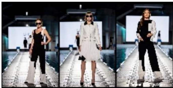
BULDOCK / Case Study: Tallinn Fashion Week 2024 https://www.esc.guide/post/buldock-case-study-tallinn-fashion-week-2024

Transform your next event with BulDock's versatile floating platforms. Enjoyed by thousands at the 2024 Tallinn Fashion Week, our floating runway at Kalev Spa showed how water can be turned into a spectacular event space.