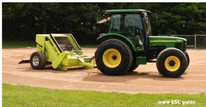
28/06/16: Removing Stones from Infields with the Barber TURF RAKE

This allows you to comfortably accommodate passengers without losing a large fish platform. UMS 655 DC Fishing is equipped with a convertible type awning, which is stored in a special locker of the aft fish platform. This makes unfolding the awning much faster and easier in bad weather. The boat easily goes to plane at full load with a 150 h.p. engine.