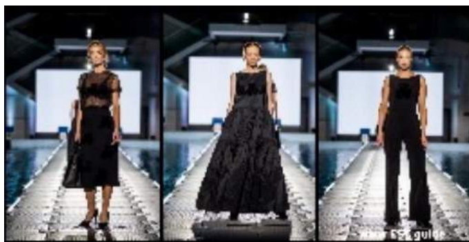
BULDOCK / Case Study: Tallinn Fashion Week 2024 https://www.esc.guide/post/buldock-case-study-tallinn-fashion-week-2024

Transform your next event with BulDock's versatile floating platforms. Enjoyed by thousands at the 2024 Tallinn Fashion Week, our floating runway at Kalev Spa showed how water can be turned into a spectacular event space.