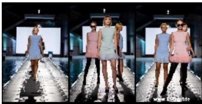
BULDOCK / Case Study: Tallinn Fashion Week 2024

Transform your next event with BulDock's versatile floating platforms. Enjoyed by thousands at the 2024 Tallinn Fashion Week, our floating runway at Kalev Spa showed how water can be turned into a spectacular event space.