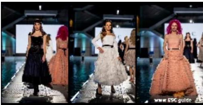
BULDOCK / Case Study: Tallinn Fashion Week 2024

Transform your next event with BulDock's versatile floating platforms. Enjoyed by thousands at the 2024 Tallinn Fashion Week, our floating runway at Kalev Spa showed how water can be turned into a spectacular event space.