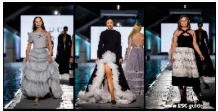
BULDOCK / Case Study: Tallinn Fashion Week 2024

Transform your next event with BulDock's versatile floating platforms. Enjoyed by thousands at the 2024 Tallinn Fashion Week, our floating runway at Kalev Spa showed how water can be turned into a spectacular event space.