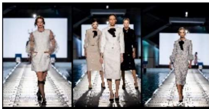
BULDOCK / Case Study: Tallinn Fashion Week 2024

Transform your next event with BulDock's versatile floating platforms. Enjoyed by thousands at the 2024 Tallinn Fashion Week, our floating runway at Kalev Spa showed how water can be turned into a spectacular event space.