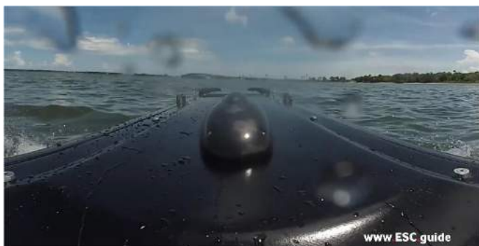
11/06/21: MANTAS T8 Speed Demonstration https://www.esc.guide/post/11-06-21-mantas-t8-speed-demonstration 2.5m #USV (video)