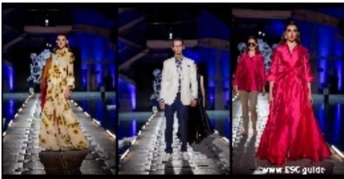
BULDOCK / Case Study: Tallinn Fashion Week 2024

Transform your next event with BulDock's versatile floating platforms. Enjoyed by thousands at the 2024 Tallinn Fashion Week, our floating runway at Kalev Spa showed how water can be turned into a spectacular event space.