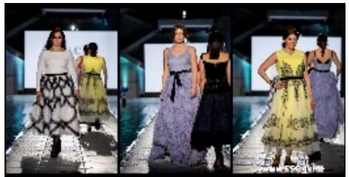
BULDOCK / Case Study: Tallinn Fashion Week 2024 https://www.esc.guide/post/buldock-case-study-tallinn-fashion-week-2024 Transform your next event with BulDock's versatile floating platforms. Enjoyed by thousands at the 2024 Tallinn Fashion Week, our floating runway at Kalev Spa showed how water can be turned into a spectacular event space.