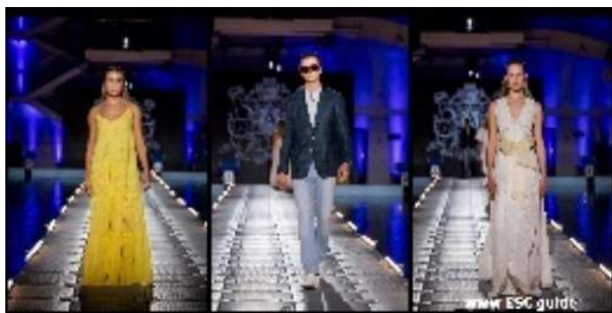
BULDOCK / Case Study: Tallinn Fashion Week 2024

Transform your next event with BulDock's versatile floating platforms. Enjoyed by thousands at the 2024 Tallinn Fashion Week, our floating runway at Kalev Spa showed how water can be turned into a spectacular event space.