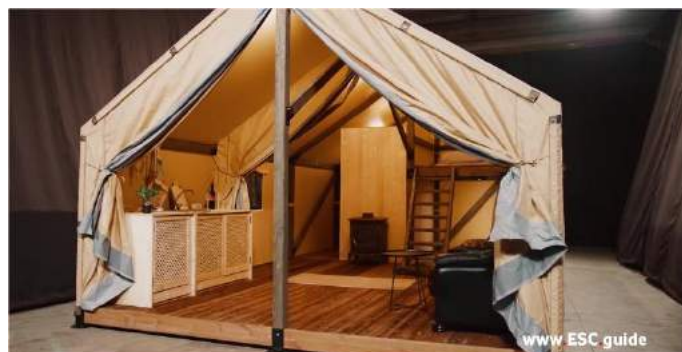
GLAMPHOUSE / Barta

Discover the Future with the Versatile Spaces that Modified Shipping Containers Offer.