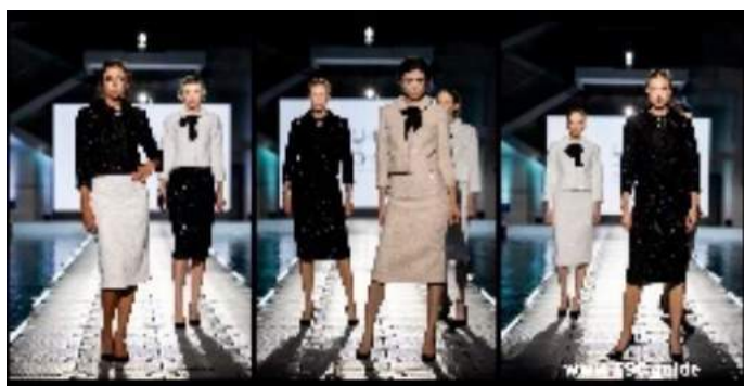
BULDOCK / Case Study: Tallinn Fashion Week 2024

Transform your next event with BulDock's versatile floating platforms. Enjoyed by thousands at the 2024 Tallinn Fashion Week, our floating runway at Kalev Spa showed how water can be turned into a spectacular event space.