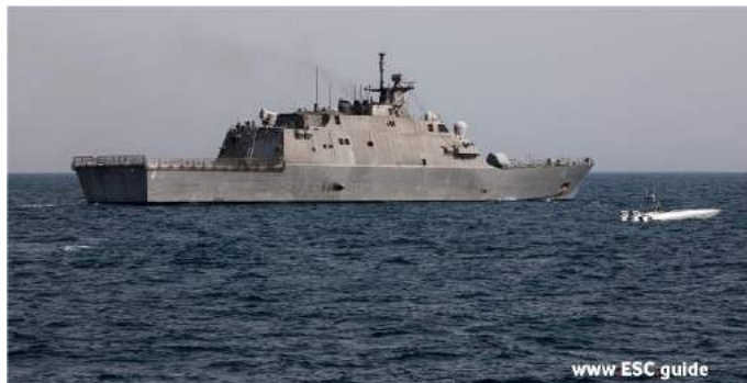
28/06/22: U.S. Navy LCS Begins First Ever Middle East Deployment

It hasn't gotten a lot of press, but #CENTCOM has seen some interesting visitors and additions in recent days.