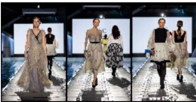
BULDOCK / Case Study: Tallinn Fashion Week 2024 https://www.esc.guide/post/buldock-case-study-tallinn-fashion-week-2024 Transform your next event with BulDock's versatile floating platforms. Enjoyed by thousands at the 2024 Tallinn Fashion Week, our floating runway at Kalev Spa showed how water can be turned into a spectacular event space.