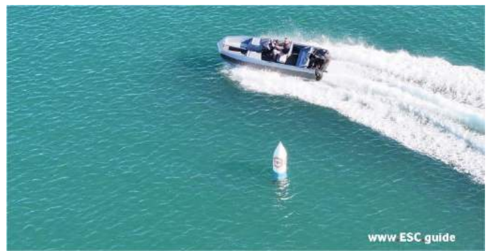
WATERCAR - EV

Barber beach cleaning machines are effective in removing beach pollution such as seaweed, dead fish, glass, syringes, plastic, cans, cigarettes, shells, stone, wood and virtually any unwanted debris. Barber beach cleaning machines are even used to effectively remove oil and tar balls from beach sand after oil spill disasters.