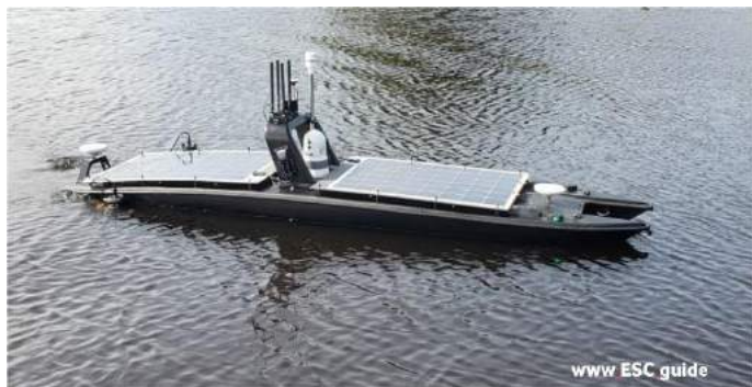
11/06/21: MANTAS T12 Environmental Monitoring System

https://www.esc.guide/post/11-06-21-mantas-t12-environmental-monitoring-system