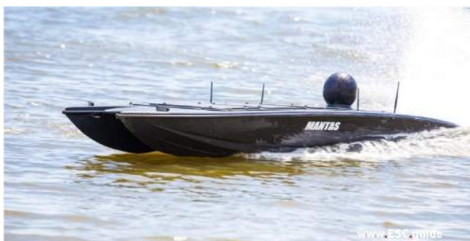
11/06/21: MANTAS T12 integrated with SeaFlir 230 and Hornets combine to perform superior covert ISR operations https://www.esc.guide/post/11-06-21-mantas-t12-integrated-with-seaflir-230-and-hornets-combine-to-perform-superior-covert-isr 3.6m #USV (video)