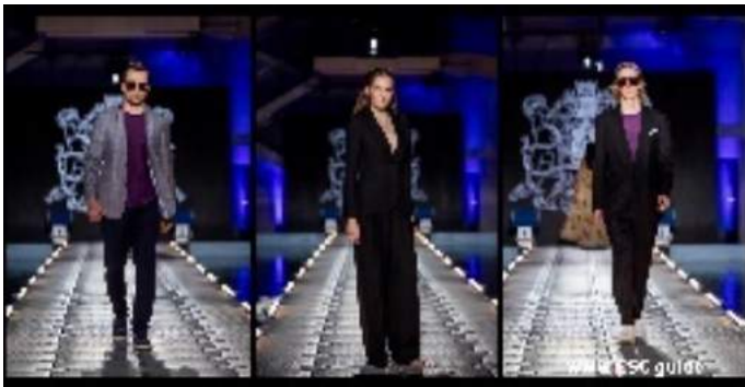
BULDOCK / Case Study: Tallinn Fashion Week 2024

https://www.esc.guide/post/buldock-case-study-tallinn-fashion-week-2024