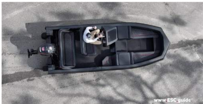
WATERCAR - EV

Glamping tent "Barta" is not just a living module, a real all-purpose in the world of glamping!