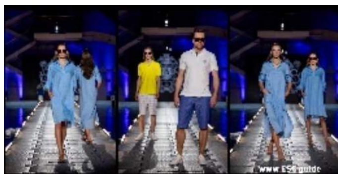
BULDOCK / Case Study: Tallinn Fashion Week 2024

Transform your next event with BulDock's versatile floating platforms. Enjoyed by thousands at the 2024 Tallinn Fashion Week, our floating runway at Kalev Spa showed how water can be turned into a spectacular event space.