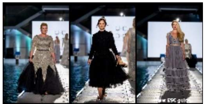
BULDOCK / Case Study: Tallinn Fashion Week 2024 https://www.esc.guide/post/buldock-case-study-tallinn-fashion-week-2024 Transform your next event with BulDock's versatile floating platforms. Enjoyed by thousands at the 2024 Tallinn Fashion Week, our floating runway at Kalev Spa showed how water can be turned into a spectacular event space.