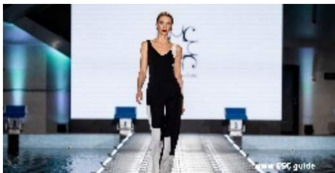
BULDOCK / Case Study: Tallinn Fashion Week 2024 https://www.esc.guide/post/buldock-case-study-tallinn-fashion-week-2024

Transform your next event with BulDock's versatile floating platforms. Enjoyed by thousands at the 2024 Tallinn Fashion Week, our floating runway at Kalev Spa showed how water can be turned into a spectacular event space.