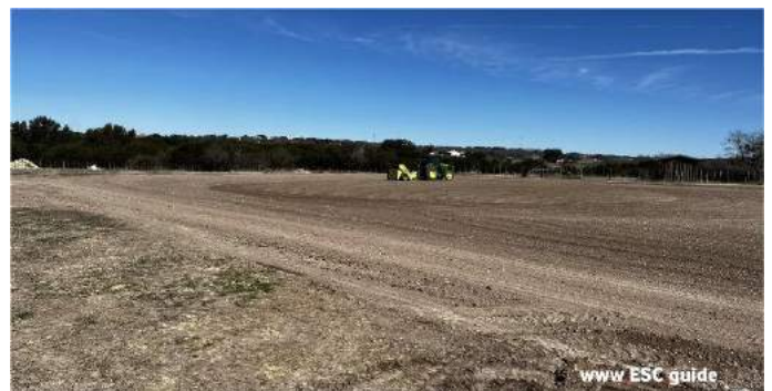
BARBER / TURF RAKE - #StonePickingMachine

Glamping tent "Barta" is not just a living module, a real all-purpose in the world of glamping!