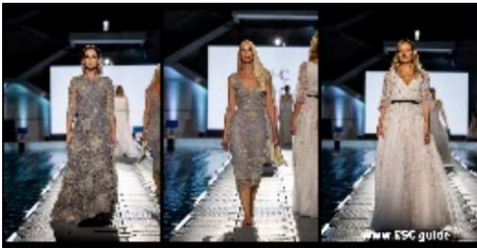
BULDOCK / Case Study: Tallinn Fashion Week 2024

https://www.esc.guide/post/buldock-case-study-tallinn-fashion-week-2024