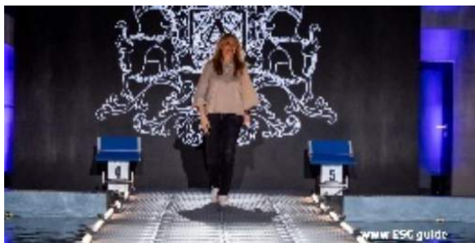
BULDOCK / Case Study: Tallinn Fashion Week 2024

https://www.esc.guide/post/buldock-case-study-tallinn-fashion-week-2024