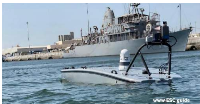
11/06/21: MANTAS T12 Gator Mode https://www.esc.guide/post/11-06-21-mantas-t12-gator-mode 3.6m #USV (video)