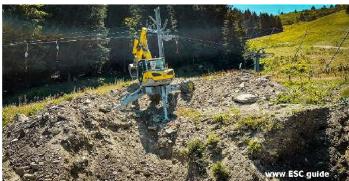
MENZI MUCK M535x

The walking excavators' special features are based on a sophisticated high-tech chassis and the patented boom: various hydraulic cylinders enable the all-rounder to adapt its wheels and supports to any terrain.