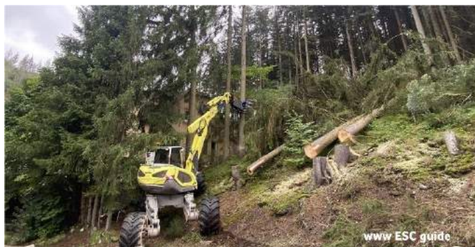
MENZI MUCK #Logging

The end product speaks for the skill and tenaciousness of the #WaterCar team in USA. Capable of highway speeds on land and thirty-five knots on water, the four-wheel-drive H1-Panther transitions between land and water in under 20 seconds.