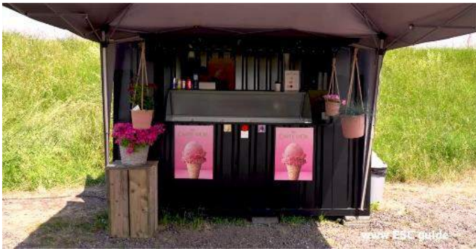
Ice Cream Shop Container 3x2 meters RAL 9005

https://www.esc.guide/post/ice-cream-shop-container-3x2-meters-ral-9005