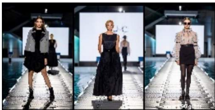
BULDOCK / Case Study: Tallinn Fashion Week 2024 https://www.esc.guide/post/buldock-case-study-tallinn-fashion-week-2024

Transform your next event with BulDock's versatile floating platforms. Enjoyed by thousands at the 2024 Tallinn Fashion Week, our floating runway at Kalev Spa showed how water can be turned into a spectacular event space.