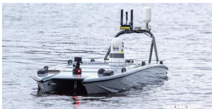
11/06/21: MANTAS T-series executing self-righting protocol https://www.esc.guide/post/11-06-21-mantas-t-series-executing-self-righting-protocol Platforms T12 & T8 demonstration (video)