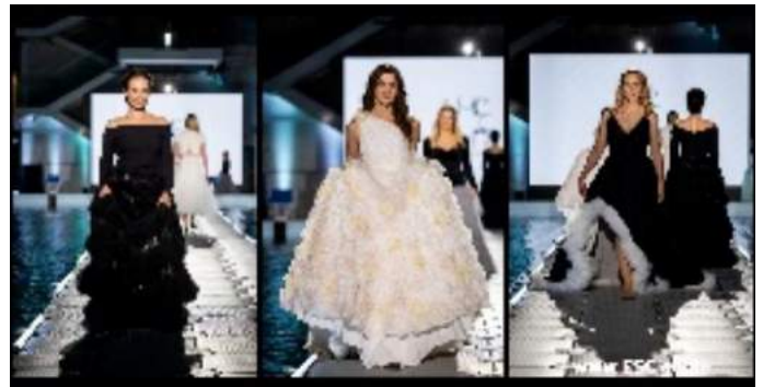
BULDOCK / Case Study: Tallinn Fashion Week 2024

Transform your next event with BulDock's versatile floating platforms. Enjoyed by thousands at the 2024 Tallinn Fashion Week, our floating runway at Kalev Spa showed how water can be turned into a spectacular event space.