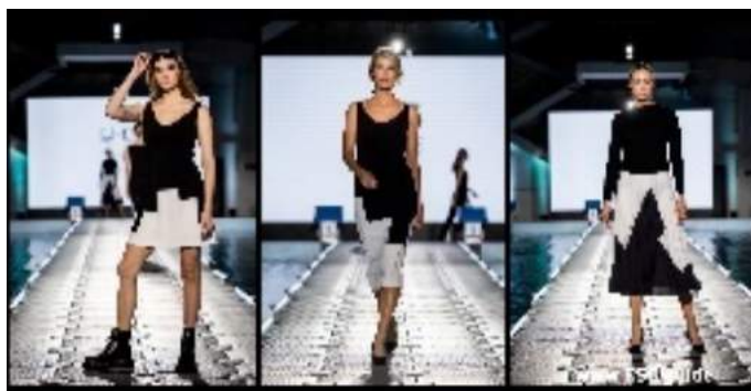
BULDOCK / Case Study: Tallinn Fashion Week 2024 https://www.esc.guide/post/buldock-case-study-tallinn-fashion-week-2024

Transform your next event with BulDock's versatile floating platforms. Enjoyed by thousands at the 2024 Tallinn Fashion Week, our floating runway at Kalev Spa showed how water can be turned into a spectacular event space.