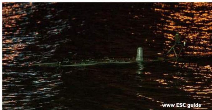
11/06/21: MANTAS T12 ISR Gator Mode Visualization Study

https://www.esc.guide/post/11-06-21-mantas-t12-isr-gator-mode-visualization-study