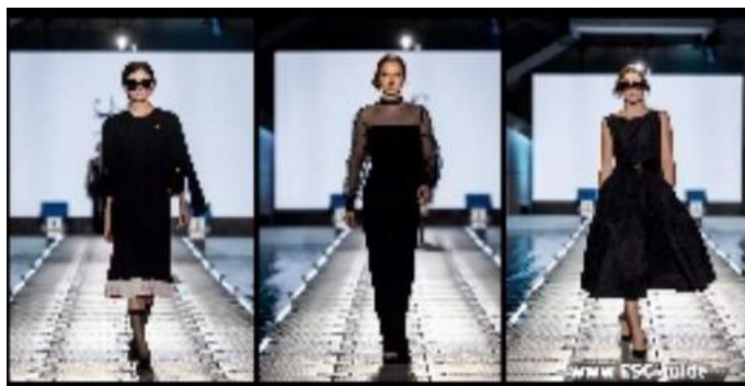
BULDOCK / Case Study: Tallinn Fashion Week 2024 https://www.esc.guide/post/buldock-case-study-tallinn-fashion-week-2024

Transform your next event with BulDock's versatile floating platforms. Enjoyed by thousands at the 2024 Tallinn Fashion Week, our floating runway at Kalev Spa showed how water can be turned into a spectacular event space.