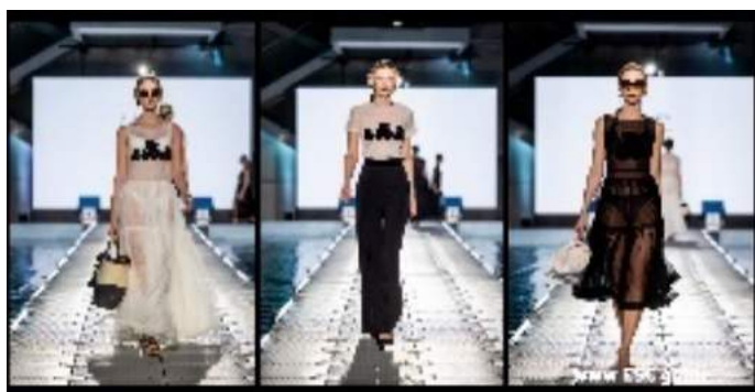
BULDOCK / Case Study: Tallinn Fashion Week 2024

https://www.esc.guide/post/buldock-case-study-tallinn-fashion-week-2024