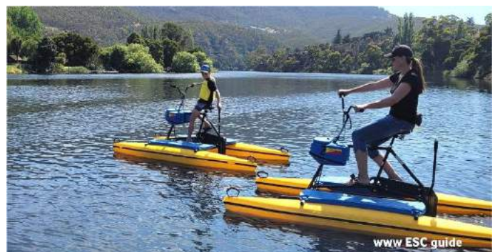
HYDROBIKES For #Moms

The walking excavators' special features are based on a sophisticated high-tech chassis and the patented boom: various hydraulic cylinders enable the all-rounder to adapt its wheels and supports to any terrain.