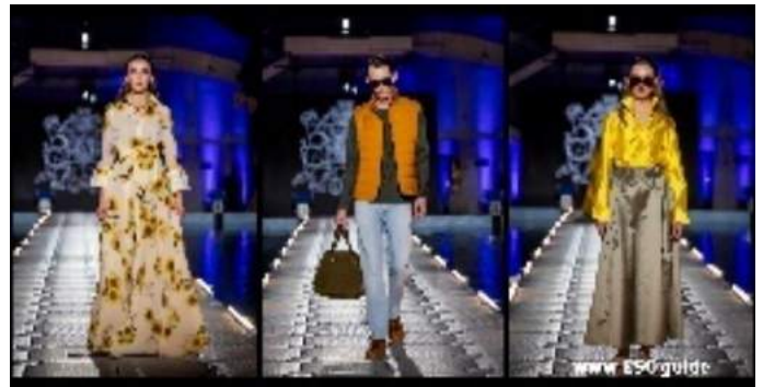
BULDOCK / Case Study: Tallinn Fashion Week 2024

Transform your next event with BulDock's versatile floating platforms. Enjoyed by thousands at the 2024 Tallinn Fashion Week, our floating runway at Kalev Spa showed how water can be turned into a spectacular event space.