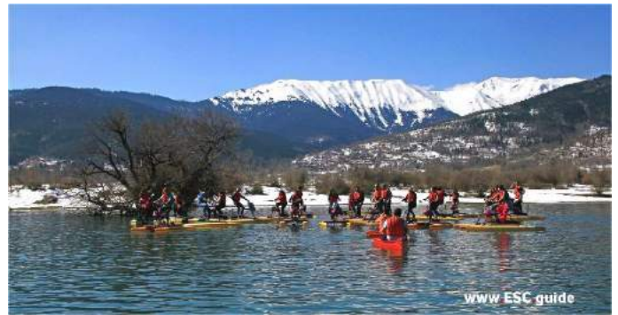
HYDROBIKES in Lake #Plastira (#GREECE) Tavropos Activities

The 3x2 Ice Cream Shop Container from Bar Container installed in a parking lot to serve customers on a sunny day.