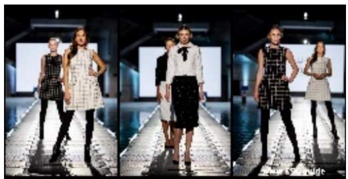
BULDOCK / Case Study: Tallinn Fashion Week 2024

Transform your next event with BulDock's versatile floating platforms. Enjoyed by thousands at the 2024 Tallinn Fashion Week, our floating runway at Kalev Spa showed how water can be turned into a spectacular event space.