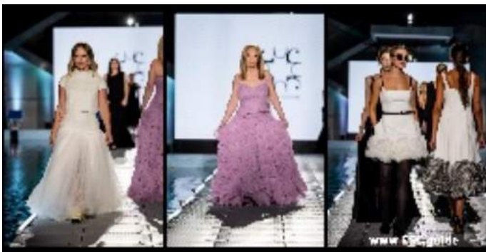
BULDOCK / Case Study: Tallinn Fashion Week 2024 https://www.esc.guide/post/buldock-case-study-tallinn-fashion-week-2024 Transform your next event with BulDock's versatile floating platforms. Enjoyed by thousands at the 2024 Tallinn Fashion Week, our floating runway at Kalev Spa showed how water can be turned into a spectacular event space.