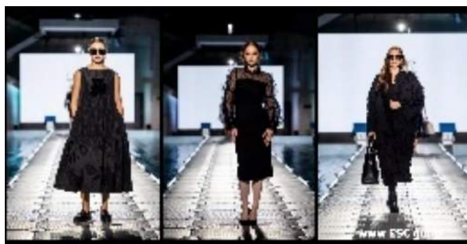
BULDOCK / Case Study: Tallinn Fashion Week 2024

Transform your next event with BulDock's versatile floating platforms. Enjoyed by thousands at the 2024 Tallinn Fashion Week, our floating runway at Kalev Spa showed how water can be turned into a spectacular event space.