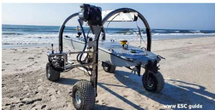
11/06/21: MANTAS T12 Speed Demonstration https://www.esc.guide/post/11-06-21-mantas-t12-speed-demonstration 3.6m #USV (video)